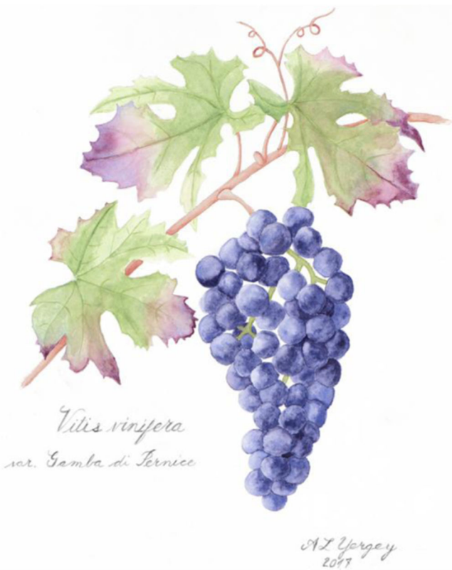
Botanical Illustration Vitis vinifera – var. Gamba di Pernice (Wine Grapes)