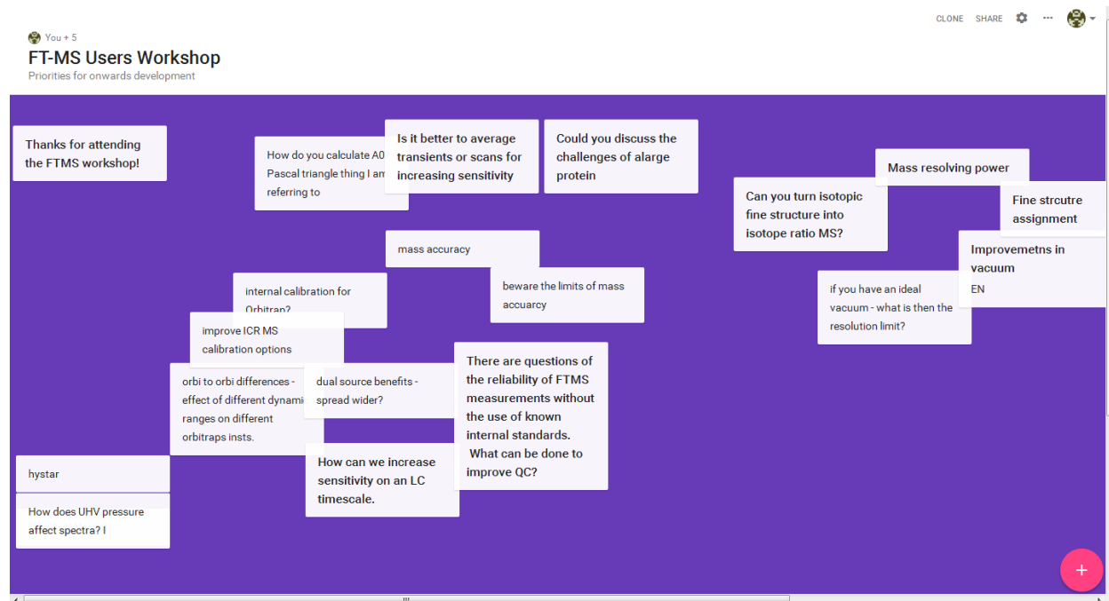
Figure 2: Padlet from open discussion at the 2016 ASMS FTMS workshop.

During the workshop, discussion points were collected using a Padlet. Padlet is website hosting virtual whiteboards/noticeboards that allow people to express and organize their collective thoughts on a common topic easily. Participants could post to the FTMS workshop Padlet, during the meeting, using web-browsers or apps on their smart phones, tablets or laptops; or by asking the chairs to post on their behalf. The Padlet produced during the workshop is shown in Figure 2 .