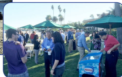
Workshop attendees socializing over ice cream treats.